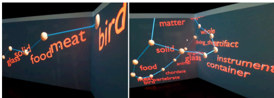
Figure 2: Examples of base network and low density network.

Here, we discuss an explorative case of visualization of semantic networks as a preliminary investigation. In the proposed system, the 3D representation will aid the systematic walkthrough representations in accordance with the directions identified in Table 1. The benefits of 3D visualization over 2D will be a better understanding the networks, inter-connections, and structures, offering an additional degree of freedom. Furthermore, stereoscopic viewing could make graphs more readable, as overlapping and non-orthogonal nodes easily make graphs unreadable. The benefits over non-virtual and less immersive visualization will be in terms of immersiveness, interaction, exploration, and dynamics. In an example of implementation, we take the network between the concepts 'bird' and 'glass' as a base network (Figure 2), visualized in a CAVE environment. Example of low density network from the base network can be seen in Figures 2 (see Table 1) [3], visualized with Fruchterman Reingold 3D layout.