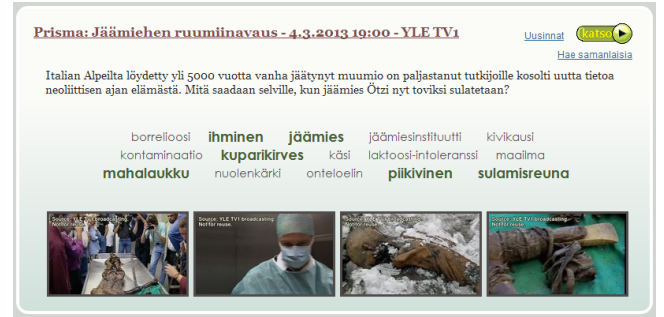
Figure 3: Catch-up TV Guide program view for a program about Ötzi the Iceman.

Novelty Cloud service provides a word cloud visualization that is generated from the extracted novelty concept words. In order to generate novelty cloud, word lists from novelty word extraction are combined to visualize novel concepts from generic, special and name word lists. To account for recurrence of novelty concepts over a series of programs in a sub-corpus, more frequent novelty words are given more weight in the cloud by increasing the font size for the most